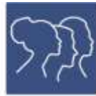
Recognising and valuing people's differences