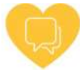
Valuing one another

Leicestershire Partnership NHS Trust upholds a culture of openness, transparency, and honesty. In support of this, the Code of Conduct Policy provides guidance to employees on the action that should be taken if they are offered gifts and/or hospitality, or, where they find themselves in a situation where there is an actual or potential conflict of interest or perception of this in the eyes of the public. All staff should adopt a code of conduct which reflects the Trust's values and behaviours and adheres to the professional standards required.