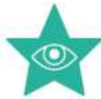
Taking personal responsibility