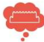
Always learning and improving