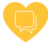
Valuing one another

Leicestershire Partnership NHS Trust upholds a culture of openness, transparency, and honesty. In support of this, the Code of Conduct Policy provides guidance to employees on the action that should be taken if they are offered gifts and/or hospitality, or, where they find themselves in a situation where there is an actual or potential conflict of interest or perception of this in the eyes of the public. All staff should adopt a code of conduct which reflects the Trust’s values and behaviours and adheres to the professional standards required.