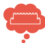
Always learning and improving