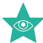
Taking personal responsibility