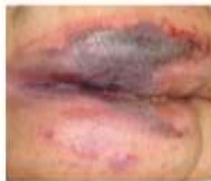
Potential deep tissue damage