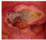
Category 4 pressure ulcer